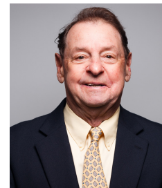
Dan Sheeran Industrial & Investment