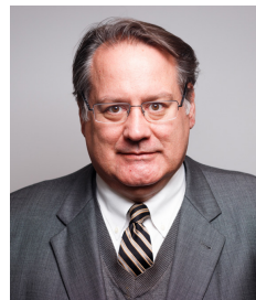
Mike Semon Industrial & Investment