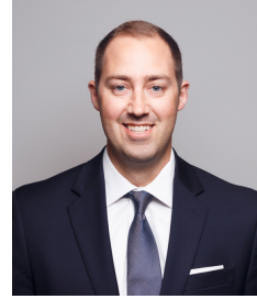
Philip Bird Office & Investment